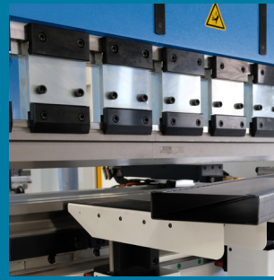
Most preferred Clamping options enabled for tooling