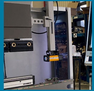
Most convenient safety options available