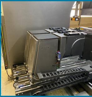
6 axis Tower Backgauges